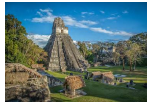
Ancient Maya periods